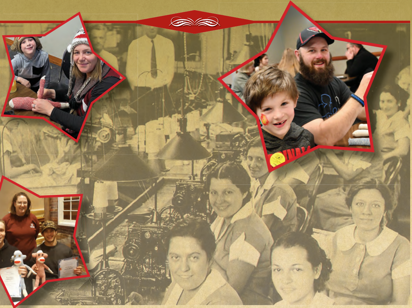
ABOVE: Rockford's Nelson Knitting Co. circa 1930, home of the famous red-heeled sock